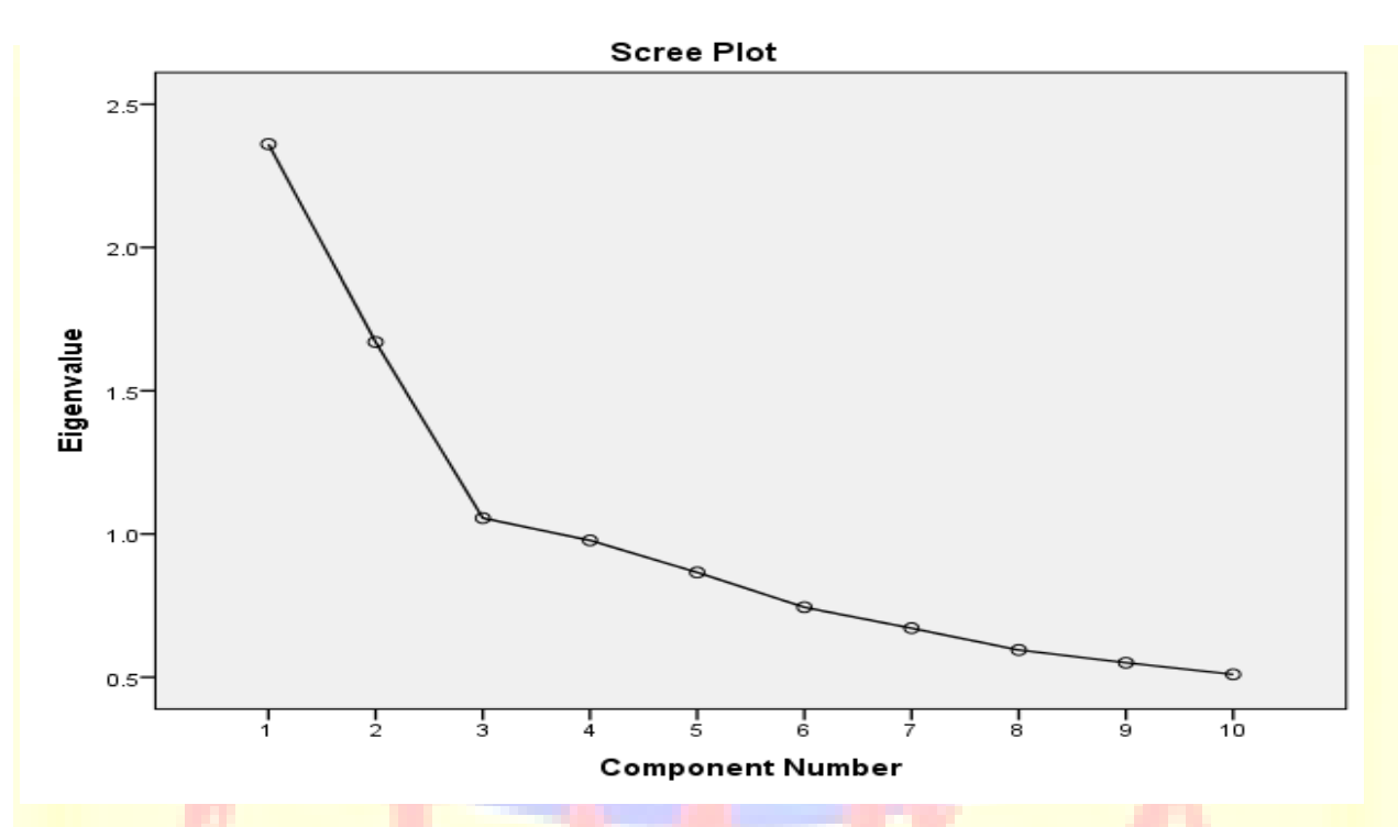
Figure 1: Important Factors Explained by Eigenvalue for Purchase of Personal Vehicles

Vehicle design and price, Economy. It is easier to focus on some key factors rather than having to consider too many variables that may be trivial, and so factor analysis is useful for placing variables into meaningful categories.